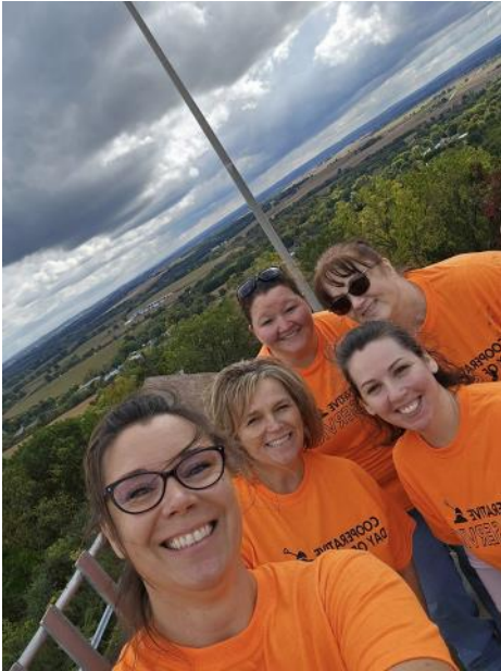
Painting Railings on Mound Hill Castle

A big THANK YOU to our Energy Cooperatives and their staff for all their efforts!