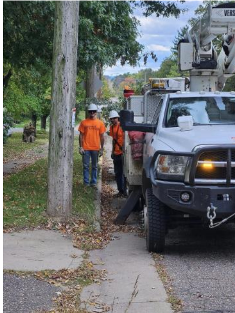
Tree Trimming on Holly Avenue