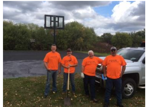
Sealcoating Basketball Court (above) Painting Bleachers (below)